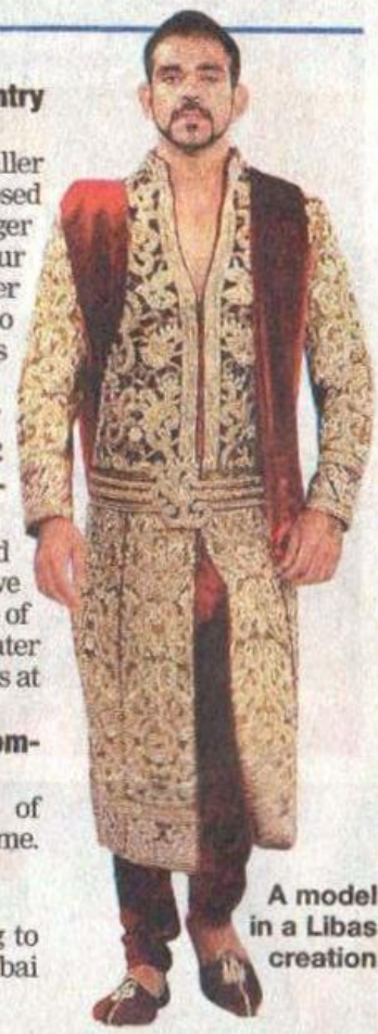
A model in a Libas creation