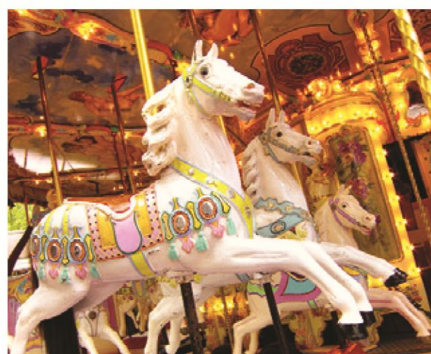
A carousel at the mall