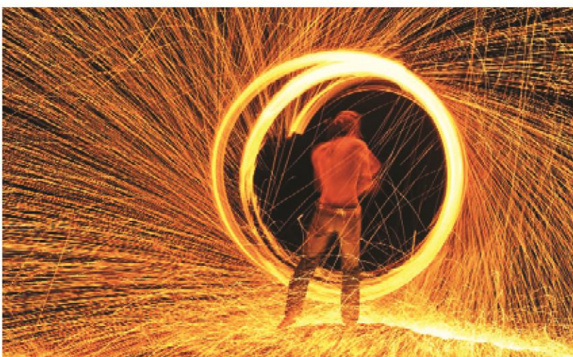
The pyro act

Korum Mall will also hold fun-filled workshops for kids and teach them how to make carousel lanterns, creative bookmarks, decorative masks, funky caps and lots more. The mall is also giving its customers a chance to win lots of goodies and a sedan as the grand prize. Over the last five years, the mall, with over 125 brands under its roof, is the key lifestyle shopping destination for people living in Thane and the central suburbs of Mumbai.